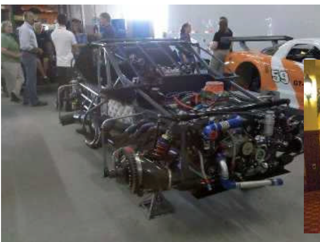
Prepare for next season (From Derhaag Open House)

Friday, January 6 at DeGidio's in St. Paul