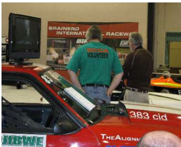
Minneapolis Auto Show

Just because the season is over doesn't mean we don't think about cars!