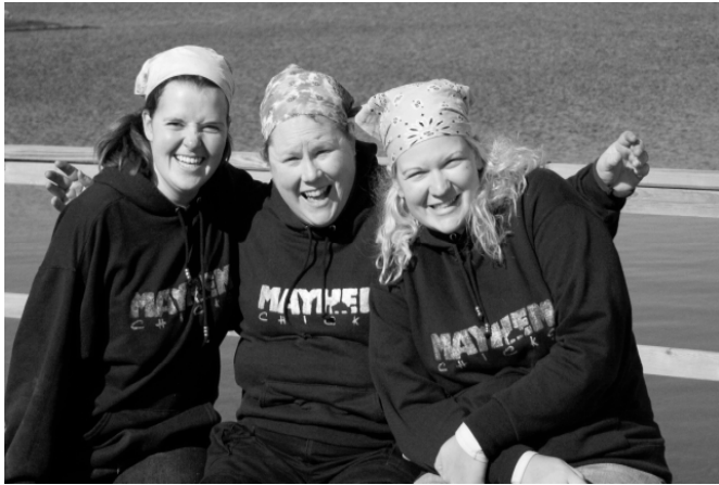
The Mayhem Chicks...live and in person!