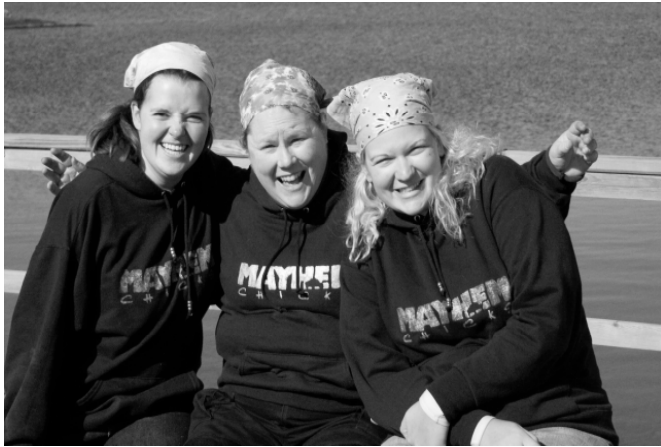
The Mayhem Chicks...live and in person!